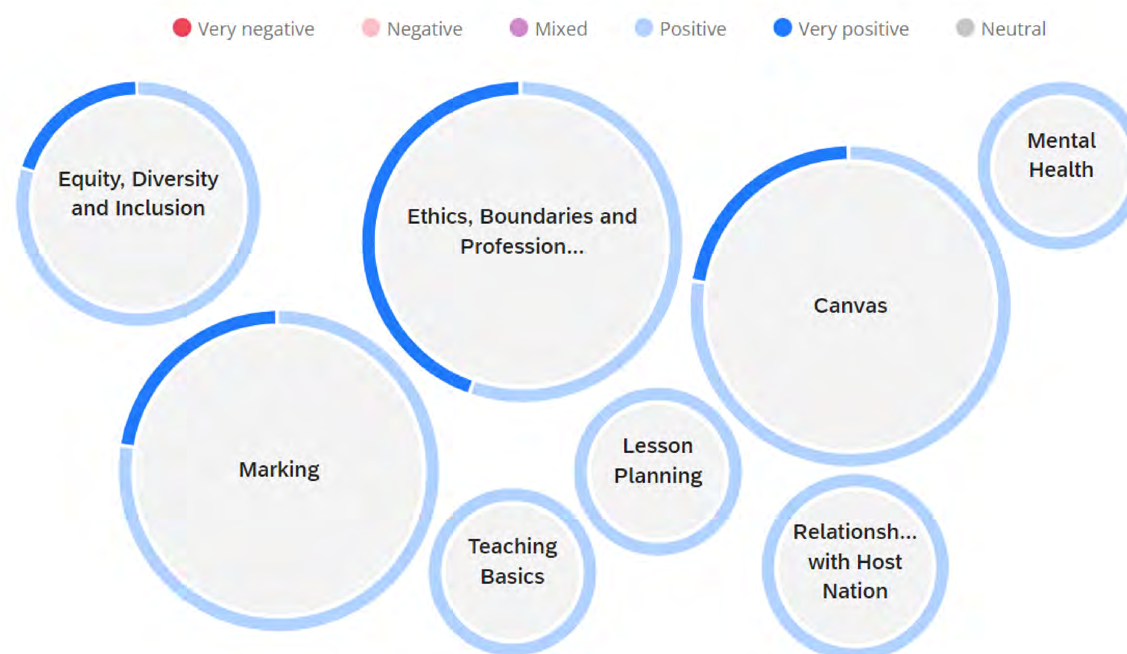
The most beneficial modules according to TAs. Bubble size shows the number of respondents who chose that module and colors indicate the emotional tone of written responses analyzed by an AI tool.