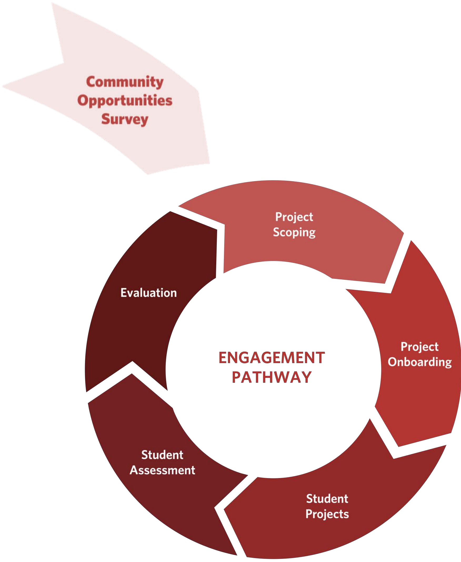
Figure 1: Community Engagement Pathway

"Too often Indigenous topics are taught from healthcare provider perspectives... hearing about healthcare from Indigenous care providers is important."