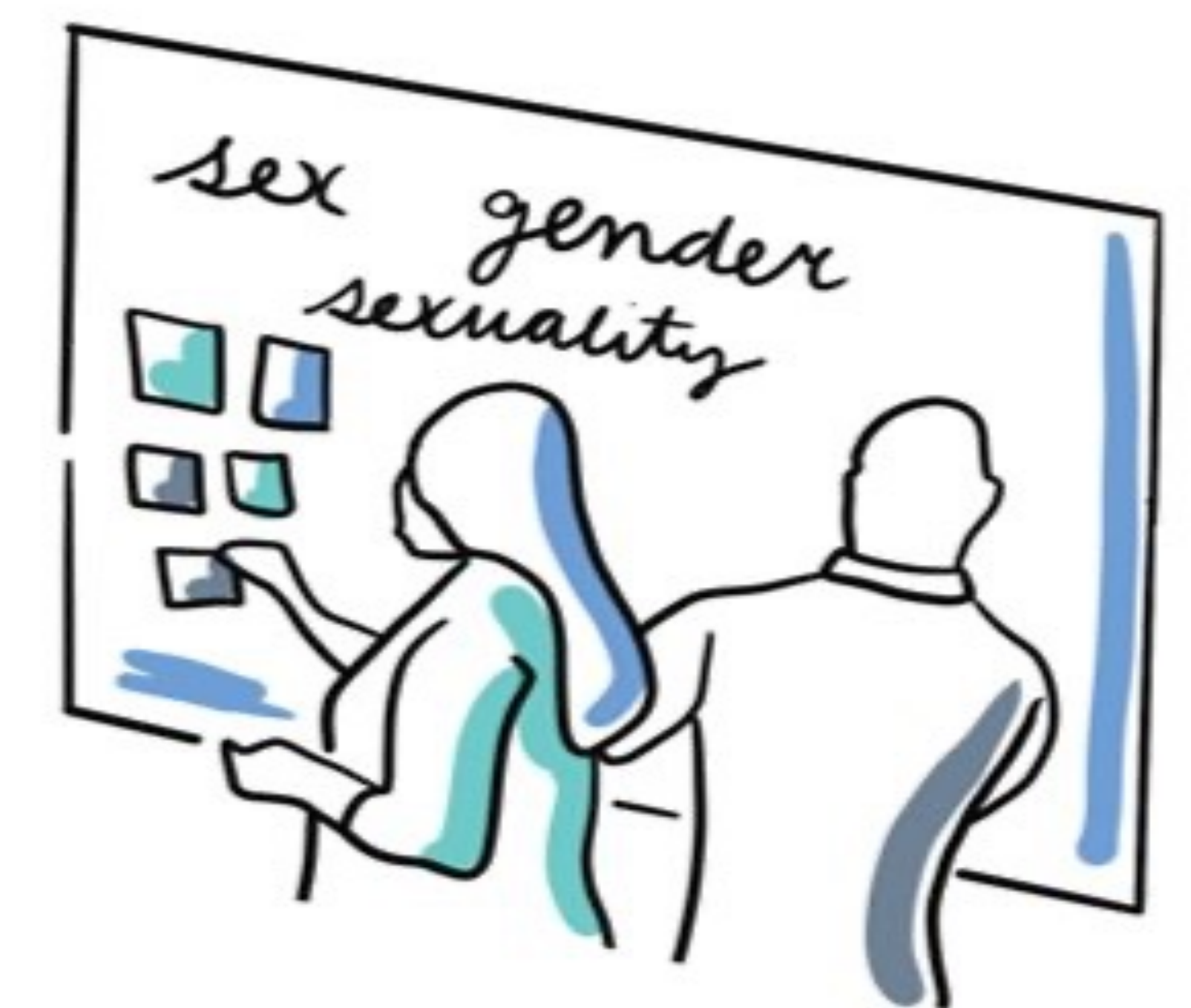
Figure 2. PHRM 100 lecture on the sex, gender, and sexuality.

Conducted an exploratory study on the pharmacy experiences of the 2SLGBTQ+ communities and made recommendations to the College of Pharmacists of BC to advance patient safety.