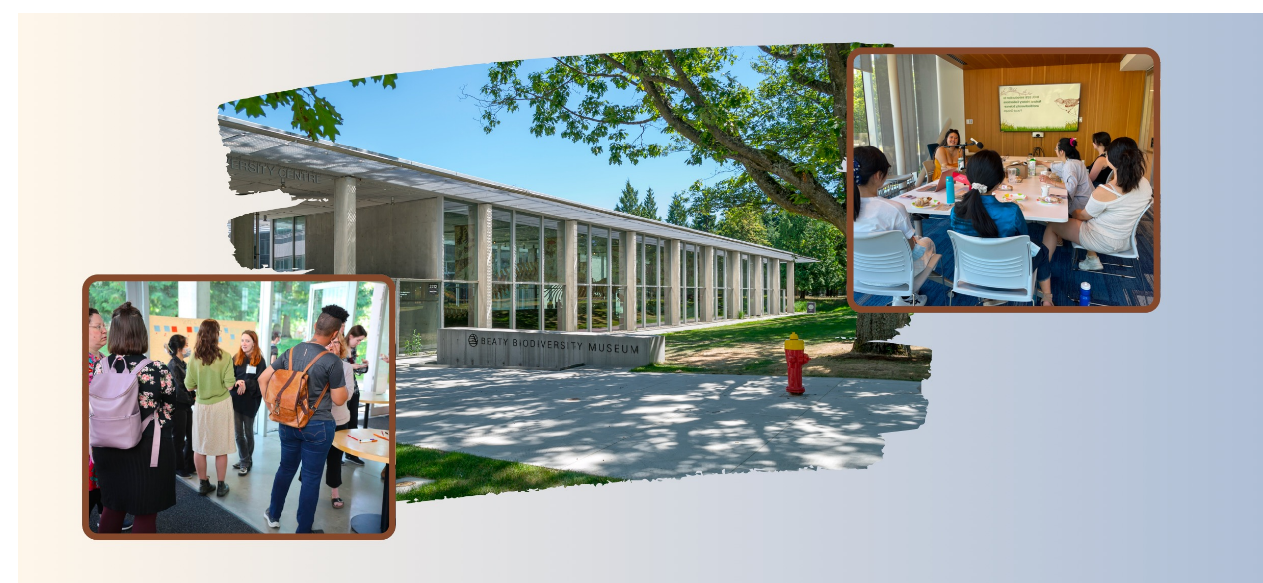
Figure 1: Snapshots of Making Connections events and the Beaty Biodiversity Museum