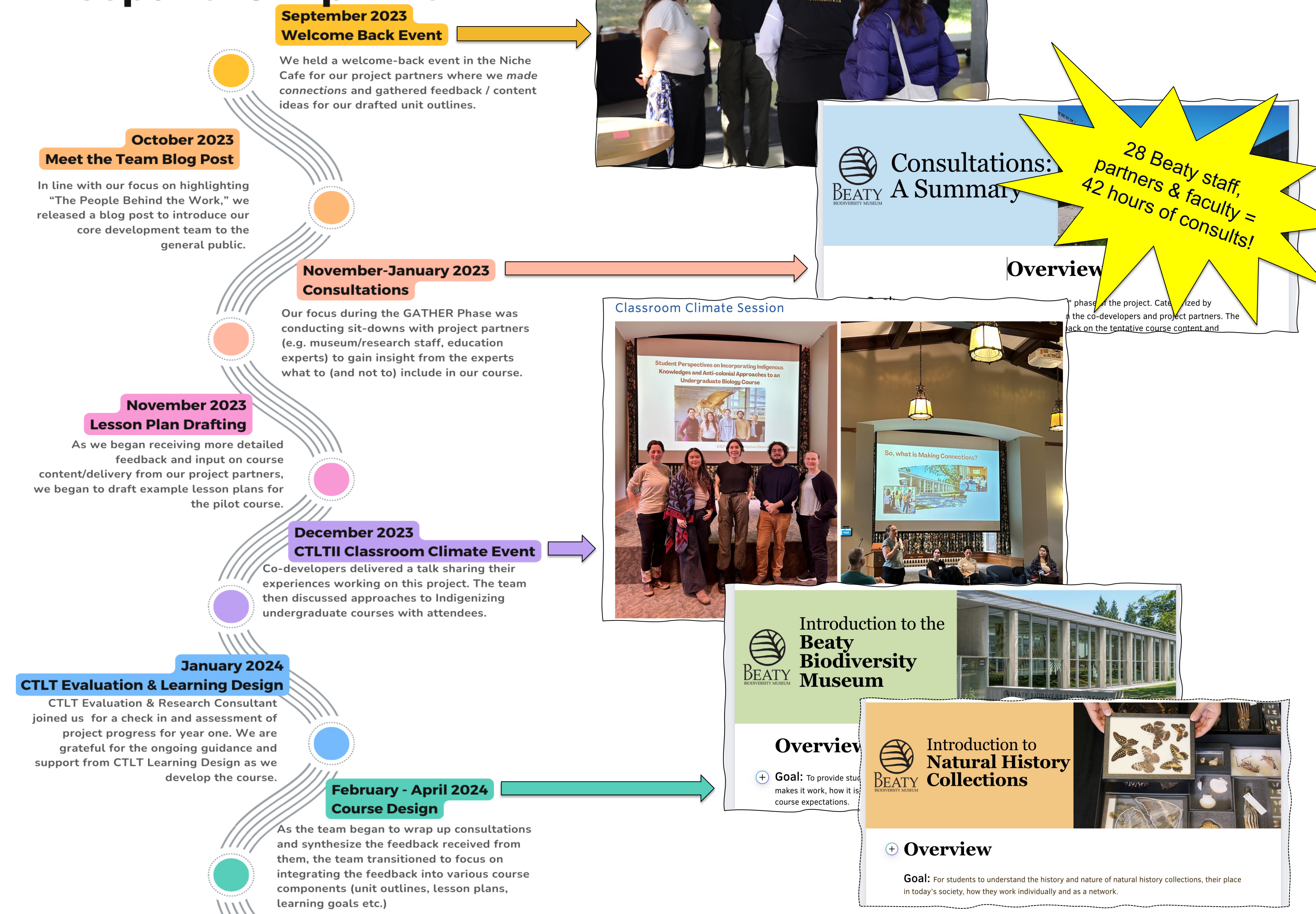
Figure 4: Summary of milestones accomplished during the GATHER phase of the Making Connections Project